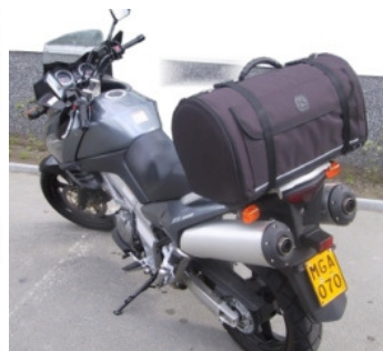
Suzuki DL650/1000 V-Strom